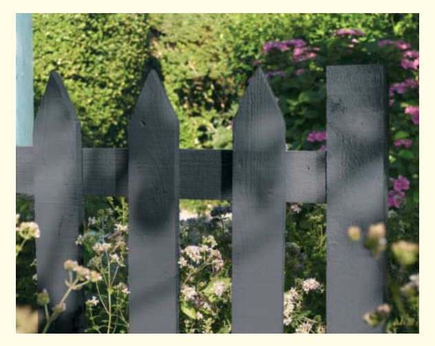
Protected from the frost with Cuprinol Ducksback in Silver Copse