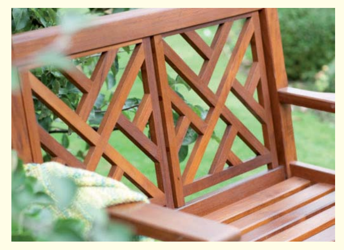
Treated with Cuprinol Garden Furniture Teak Oil.