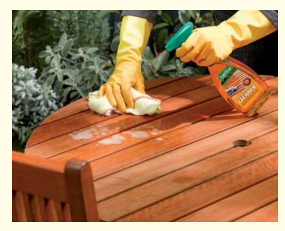
Cuprinol Garden Furniture Cleaner is ideal for on-going maintenance all year round